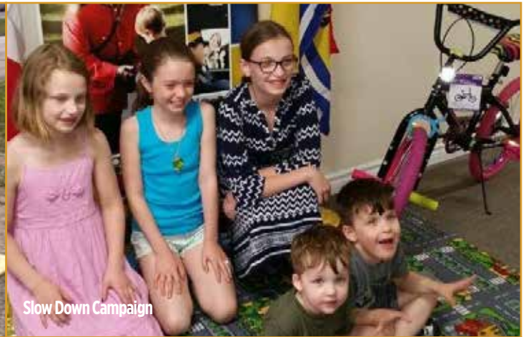
Slow Down Campaign