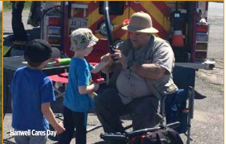
Hanwell Cares Day