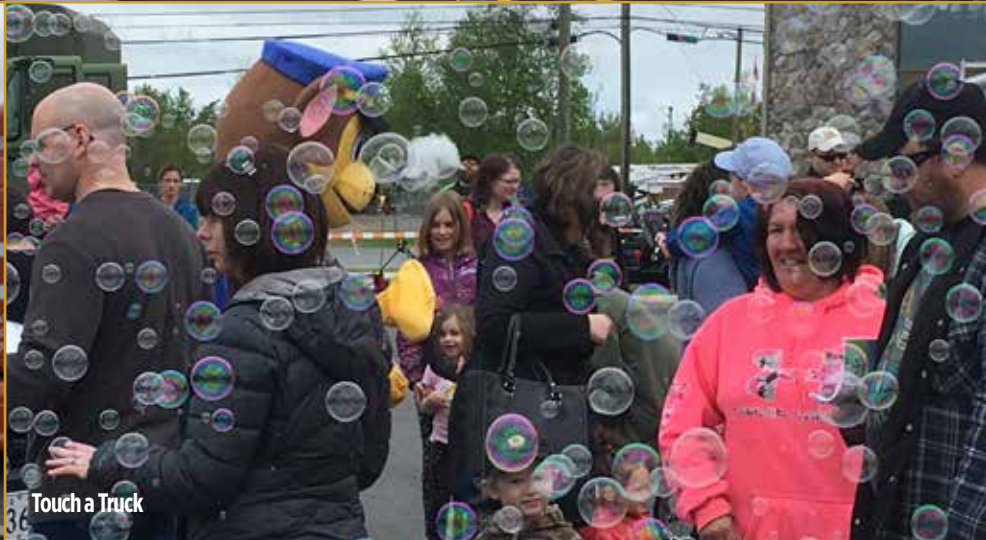
Touch a Truck