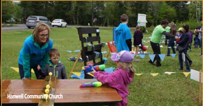
Hanwell Community Church