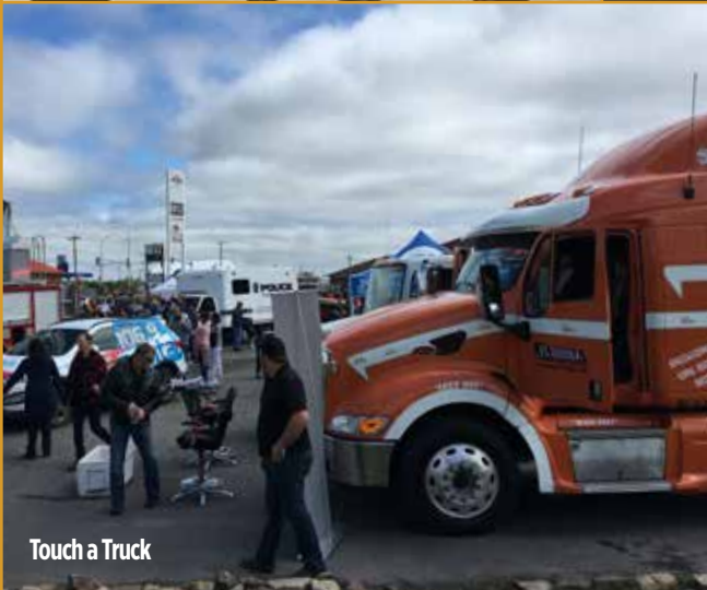
Touch a Truck