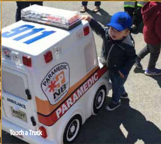
Touch a Truck