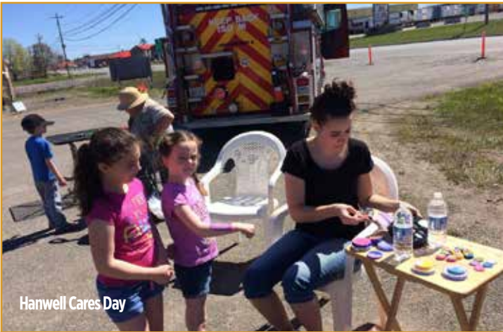
Hanwell Cares Day