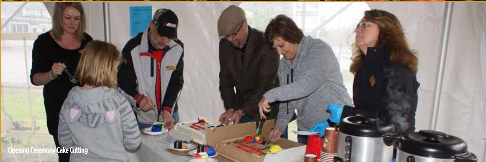
Opening Ceremony Cake Cutting