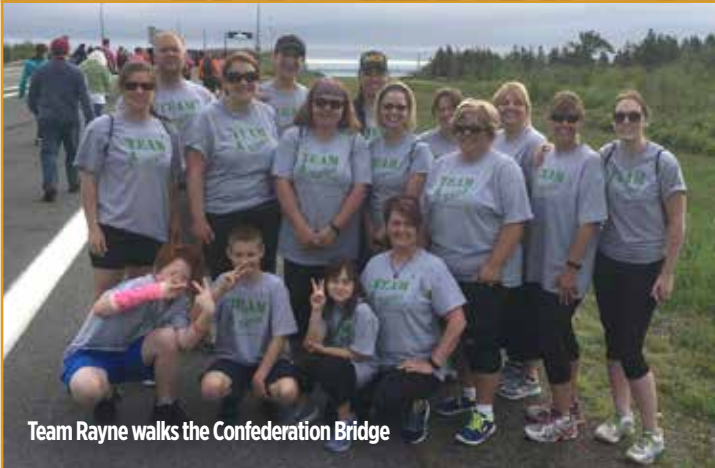
Team Rayne walks the Confederation Bridge