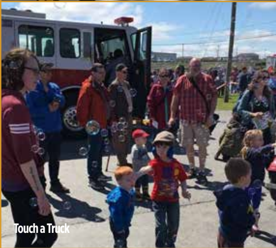
Touch a Truck