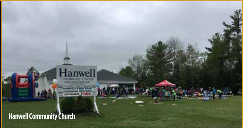
Hanwell Community Church