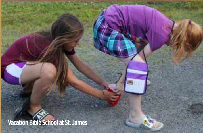
Vacation Bible School at St. James