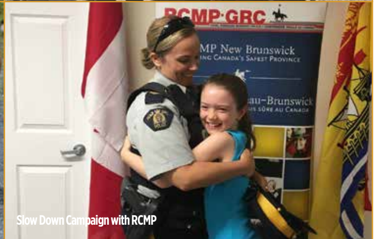
Slow Down Campaign with RCMP