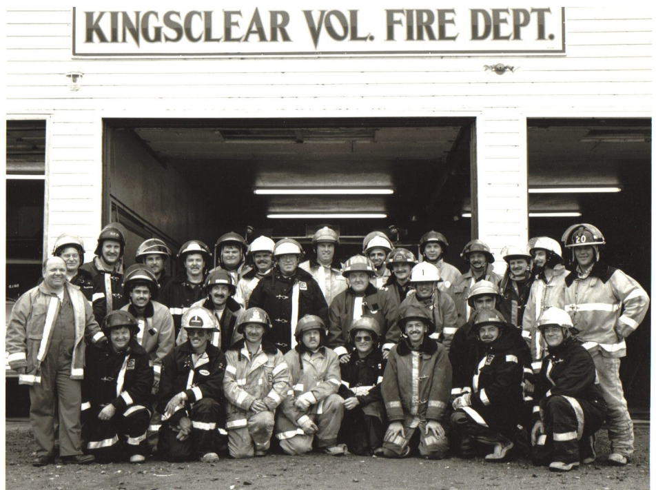
Kingsclear Volunteer Fire Department

As denoted by the root and the suffix of the word community (common-unity), our locals are unified not only by our civic addresses, but by an overwhelming sense of belonging and kinship. As part of celebrating the accomplishments of Hanwell and Upper Kingsclear, it is important to have pride in our community and recognize those individuals who devote their time and effort to uniting their fellow community members and bettering the place we all call home. In 1963, the Upper Kingsclear Fire Department was started by a few local folks with a determination to serve and protect their neighbours. This dedicated bunch contributed their time and efforts to ensure that Hanwell, as a local service district, was safe for its growing residential and commercial population. As the area continued to expand and the Rural Community of Hanwell became incorporated in 2014, the Fire Department established a temporary fire station designed to serve the 4700 residents until a permanent structure was built in 2017.