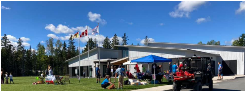
Terry Fox Run